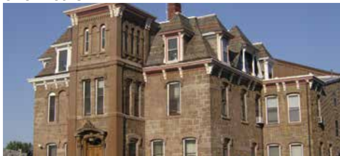
Iglesia Pentecostal Asamblea de Dios NJ church - brownstone

EaCo Chem has been producing exceptional cleaning chemicals for decades with nothing but the best results. Our chemistry has been approved worldwide on many projects. Professional cleaners that choose to stay ahead of their competition have one thing in common - the desire to be the best. That includes using the best chemicals.