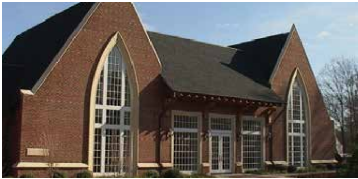
St. Johns Episcopal Church NC - brick, cast stone

EaCo Chem has been producing exceptional cleaning chemicals for decades with nothing but the best results. Our chemistry has been approved worldwide on many projects. Professional cleaners that choose to stay ahead of their competition have one thing in common - the desire to be the best. That includes using the best chemicals.