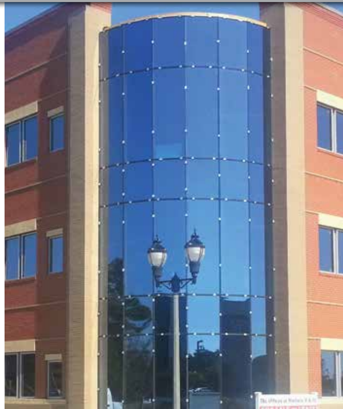
The Offices at Mayfaire NC - brick