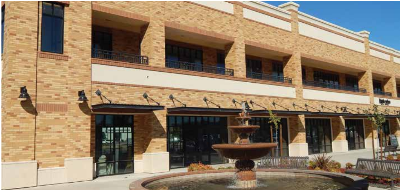
Tralee Village in Dublin, CA - multiple brick combinations

The EC Jet is a quick coupling attachment to the end of your pressure washer wand. It is designed to dilute material 4 parts water to 1 part chemical. It is used with the application of NMD 80™ or SOS 50 for new construction cleaning. The EC Jet allows for quick and accurate dilutions while spraying the chemical with the best nozzle. The open/close valve can also be used to shut off the chemical flow and allow rinsing without removing the unit. For best results, a 3 to 5 gpm pressure washer is recommended.