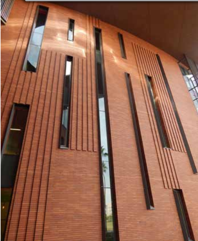
Arizona State University Hospital AZ - brick