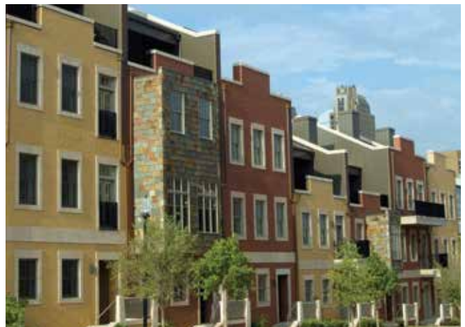
The Brownstones at Maywood Park OK - multiple substrate

NEW COMMERCIAL AND RESIDENTIAL CONSTRUCTION