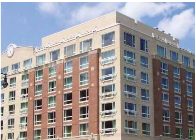
CambridgeSide Hotel MA - waterstruck brick, Arriscraft block

A powerful detergent-based solution designed for safe and effective removal of mortar smears and efflorescence from masonry surfaces. It can be used on all masonry substrates including brick, stone, synthetic stone, precast concrete, designer or colored block. The added buffering ingredients allow NMD 80 to be powerful yet safe enough for glass and anodized aluminum.