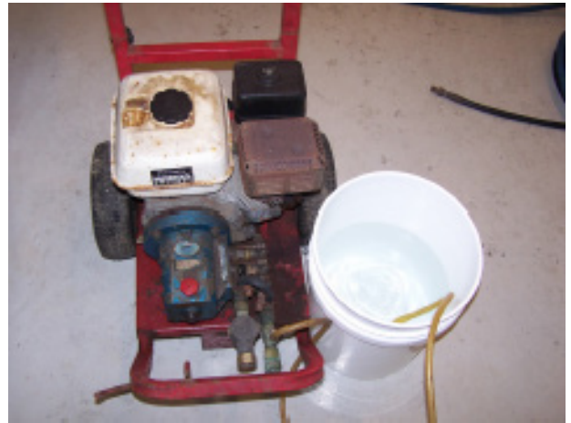
HARD PLUMBED TO PRESSURE WASHER - INSERT HOSE INTO WATER